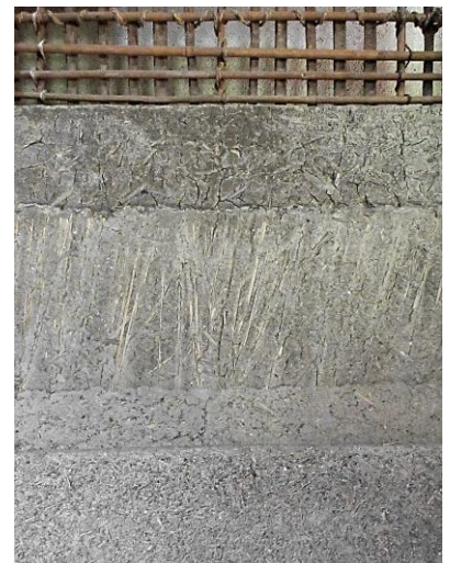
Construction of “Tsuchikabe”

It uses clay mixed with hey which is pasted on to a bamboo reinforcement and another layer of different clay is pasted for protection from rain and water.