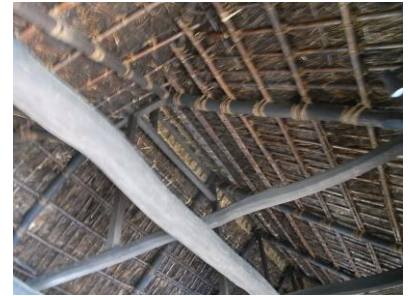
Roof seen from inside of the former Ogawa residence

Looking at the ceiling of the former Ogawa residence, you can see how the roof is built.