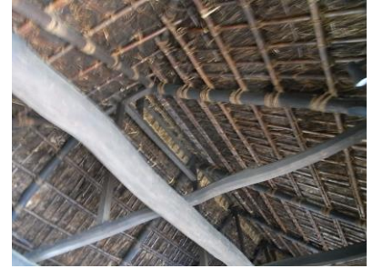
Roof seen from inside of the former Ogawa residence

Looking at the ceiling of the former Ogawa residence, you can see how the roof is built.